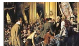
Having a Ball at the Inauguration