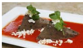
The World's Greatest Food City?