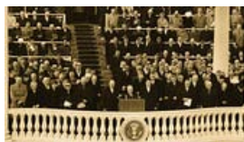
The Power of Prayer