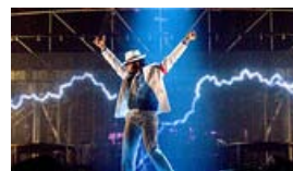
Michael Jackson: The Musical