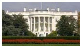
Advocates Push Pet Causes to Obamas